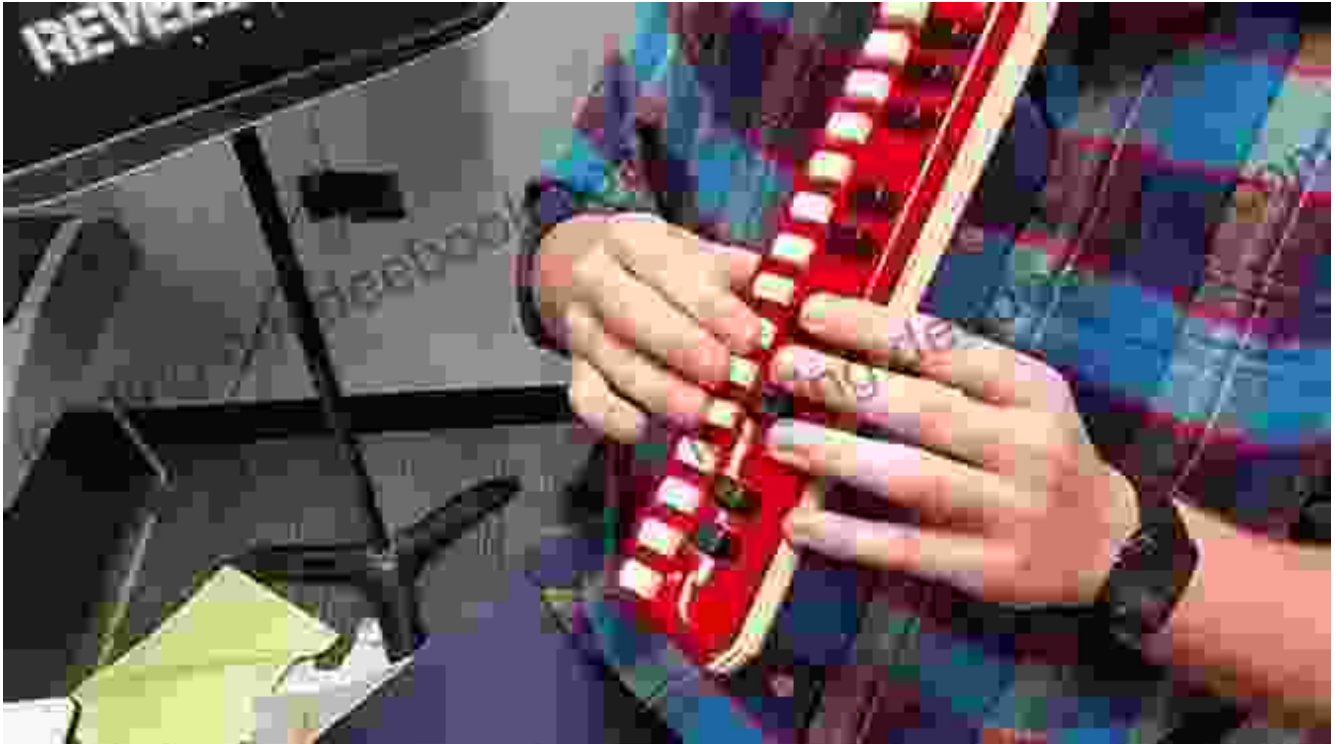
Figure 1: Playing melodica with both hands